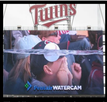
The Minnesota Twins leveraged utilities partner Pentair with an interactive video board feature