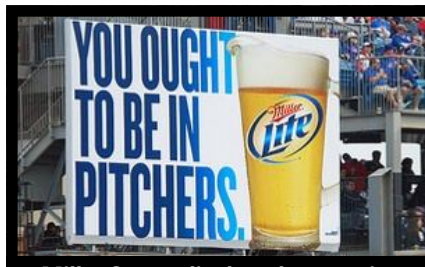
MillerCoors displayed a creative billboard at Wrigley Field when the Los Angeles Dodgers were in town to play the Chicago Cubs