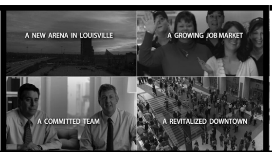
Goldman Sachs Created an Incredible Video Showcasing Its Role in Sports

wpoint with a Helmet Cam http://is.gd/WQu3HR