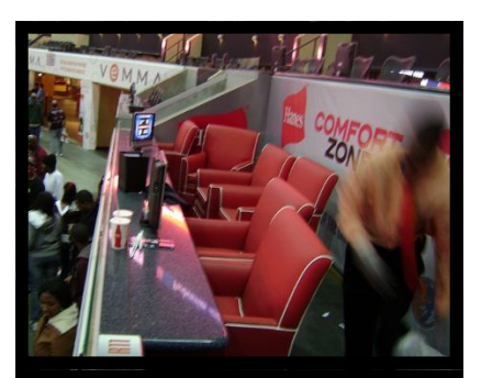
The Charlotte Bobcats partnered with Hanes to created a "Comfort Zone" loge buildout at Time Warner Cable Arena