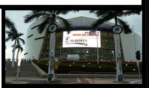
For More Info: http://is.gd/t49KJZ

supporting its palm tree countdown initiative with a Text to Win promotion where fans can text the word DRIVE to 77577 to win a pair of free playoff tickets!