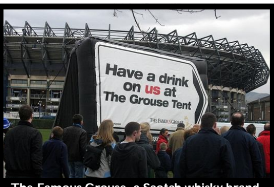
The Famous Grouse, a Scotch whisky brand, found an eye-popping way to generate excitement amongst rugby fans