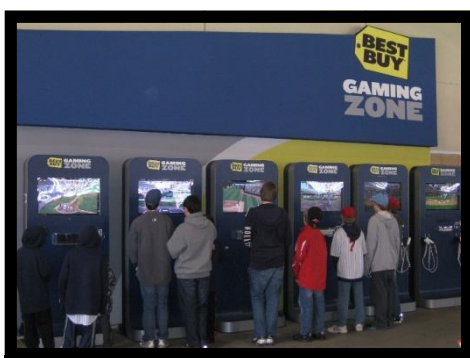
The Twins partnered with Best Buy to create an ultimate Gaming Zone for fans to enjoy free games at Target Field