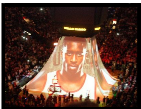
The Trail Blazers gave their team introductions a new feel with some creative projection mapping